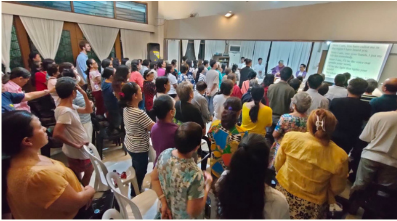
Pansol SOWers at a special All Souls' Day mass on November 2