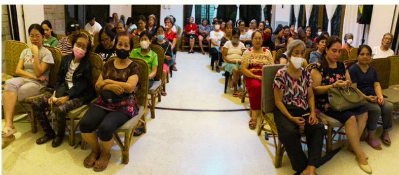
The Thursday Tagalog SOW at the Verbum Dei House in Pansol